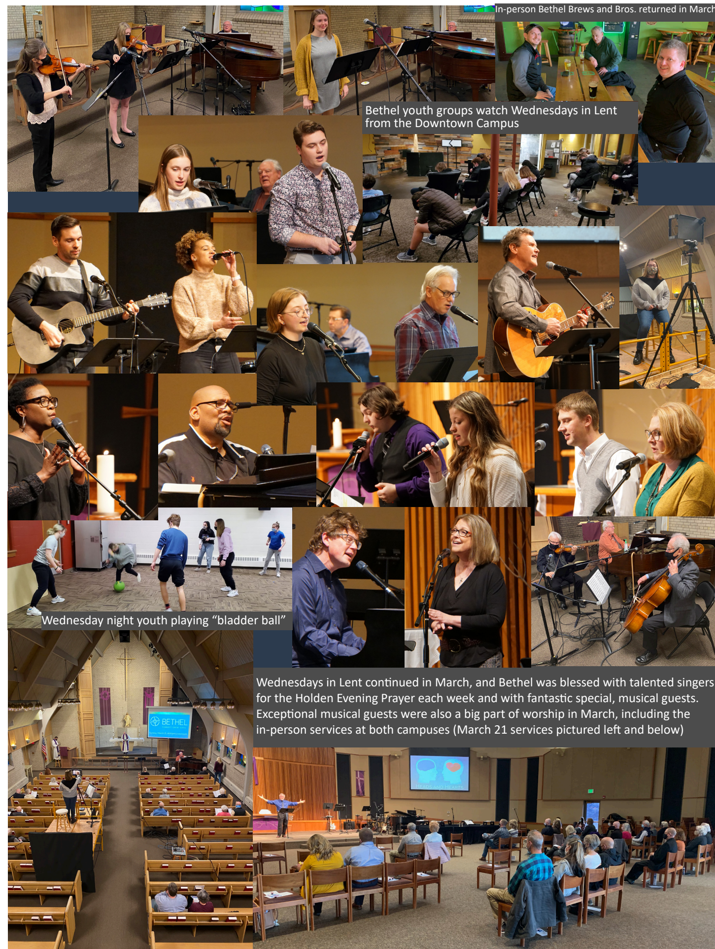
In-person Bethel Brews and Bros. returned in March