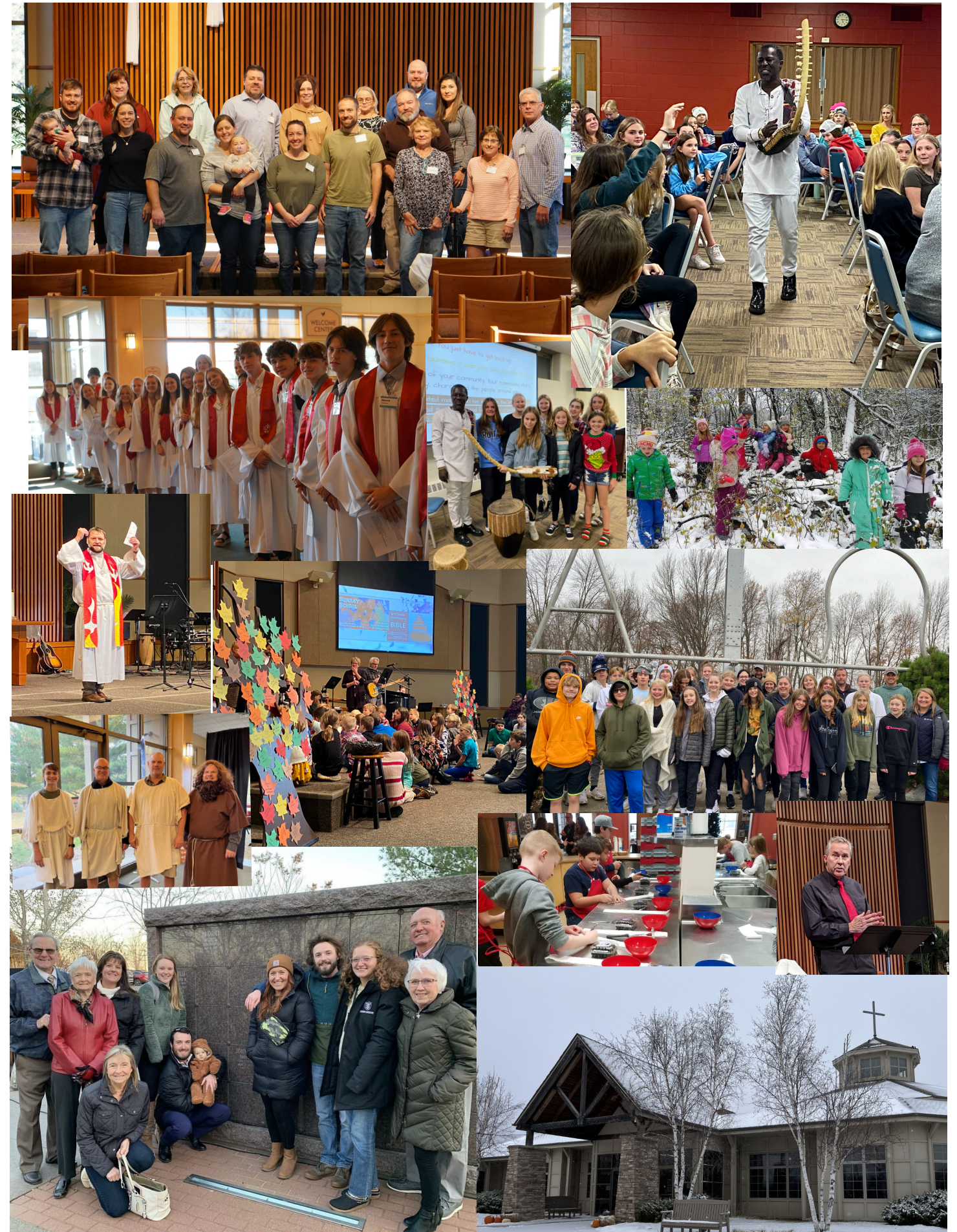
Visit Bethel's Facebook page to view more photos from recent events

Facebook: FACEBOOK.COM/BLCHUDSON/ YouTube: YOUTUBE: BETHEL LUTHERAN CHURCH HUDSON WI Instagram: INSTAGRAM: BETHELHUDSON Email: BETHEL@BETHELHUDSON.ORG