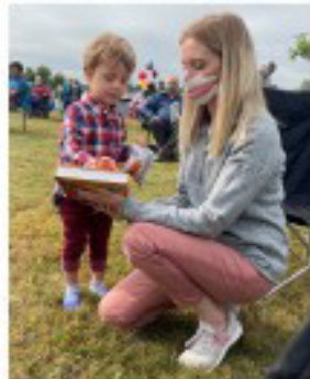
3 year-olds received and blessed their bibles at the last outdoor worship service